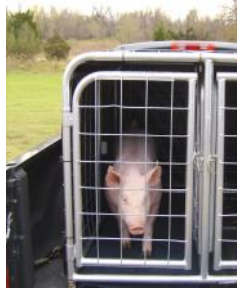
PT5, PT6, PT8 - Tote for Pigs with Four Compartments