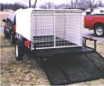
Custom totes can be made to fit landscape and flatbed trailers