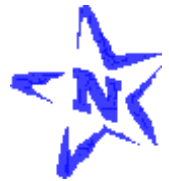
See our price sheet or contact us for current pricing on totes, pens and loading chutes.