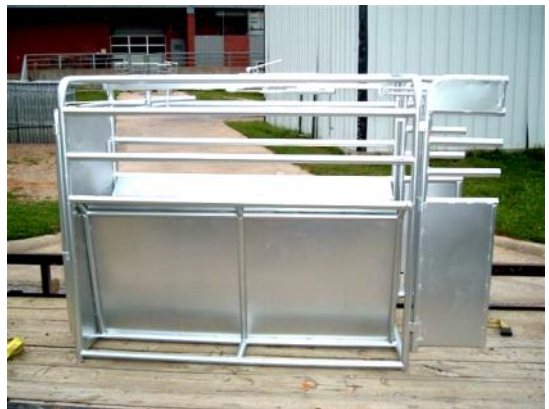
Stripping and Roping Chutes available in electric, remote, and standard options.