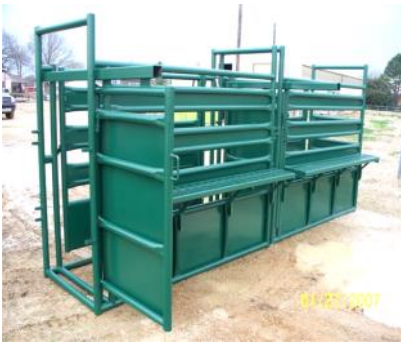
Photos of our quality bucking chute systems. Options Available.