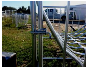
New spring-loaded latch helps to prevent livestock from opening gates