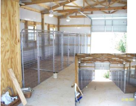
Miniature Horse Stalls but can be used for other livestock as well as kennel applications.