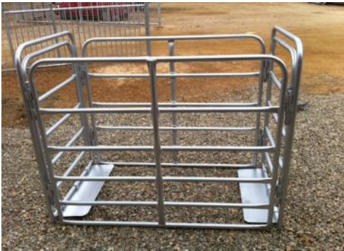
Calf Scale Cage, easy way to keep track of your calves birth weight without the expense of the high dollar large livestock scales. Scales available that weigh livestock up to 700lbs.