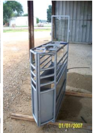
Smaller version of our calf roping chute.