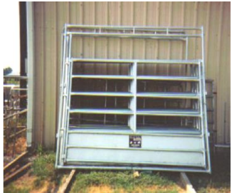
Round Pen gates and panels. Many sizes and options available, call for pricing.