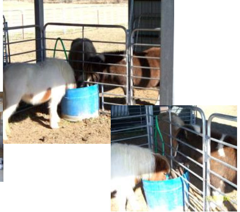
New Water Gate Panel - allows for two areas to share the same trough or allow for feed systems.