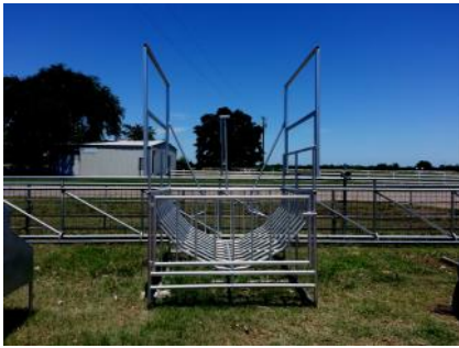
BB1000R - The roofing system opens up to help in the loading process.