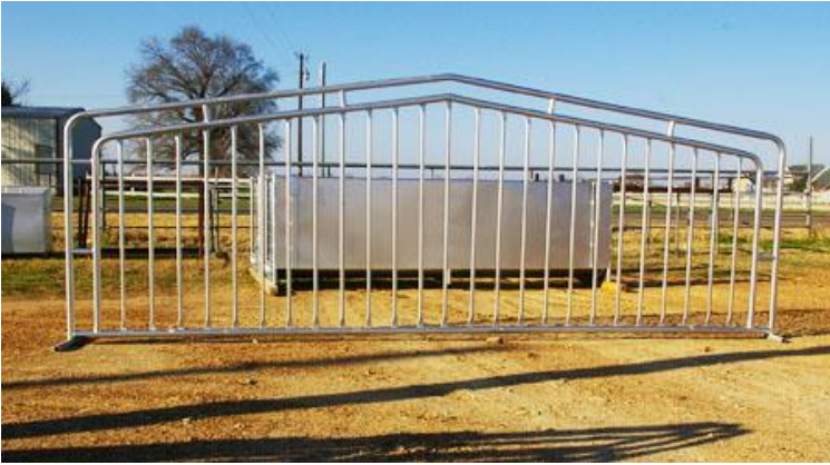
If you are looking to add a personalized farm/ranch gate, we can make those too... From swing gates on up to large scale sliding roller gates, colors are also an option for these