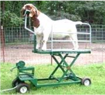
BUTLER - Goat Butler, a unique scissor stand, dollies and raises stock to working levels.