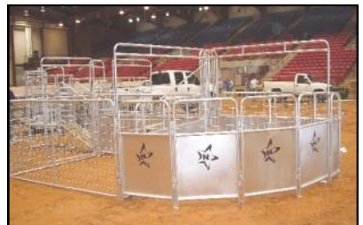
Working Chute Systems