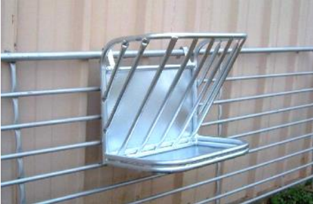
GFKP - Show Pen Feeder, also known as Small Hanging Stall Feeder