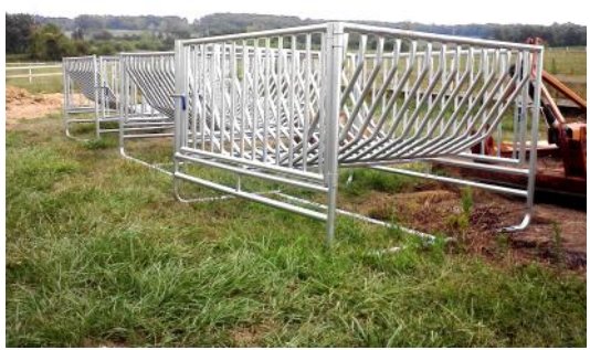
BB1000 - These big bale feeders can also be made with 4x4 wire in place of the vertical bars and with doors that swing open for easy loading