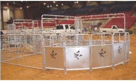
GSTBAS - Our Equipment allows for Various Working Chute configurations