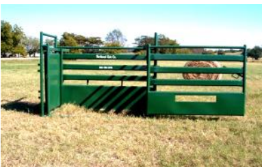
Rough Stock Bucking Chute