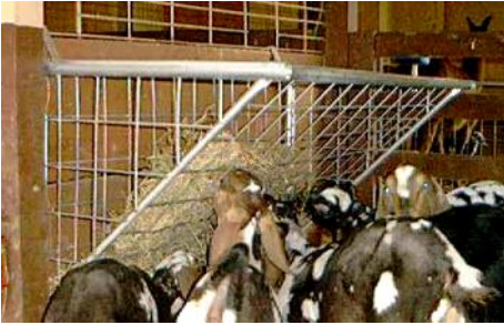
WMHR4 - 4' Wall Mount Hayrack