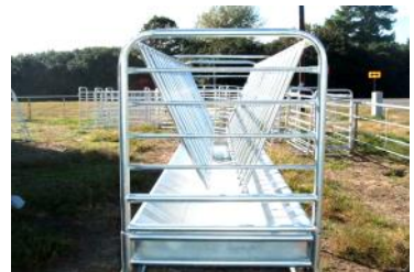
HF8 - 8' Heavy Duty Hay Rack vertical bars.