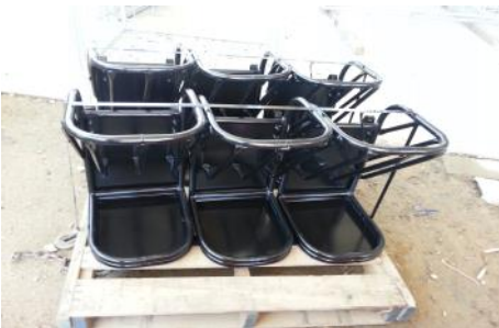
GFMINI- Mini Hanging Stall Feeder, these are great for show pens, equipment can be powder coated, many color choices