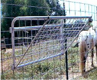
Wall Mount Hay Rack for mounting on walls or hanging over panels.