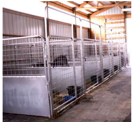
4x4 wire with kick plates on the side panels, miniature horse stalls