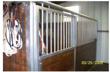
Stalls designed with grills and frames designed for lumber, plywood or sheet metal. Other style options.

Horse stalls come with swinging doors or sliding roller doors. Add-ons include swing out feed door, bucket door, and feeder.