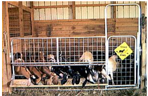
EZG410 - EZ Feeder Panel with Walkthrough Bowgate