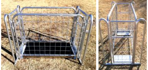
SC660 - Scale Cage and VS660 - Digital Scale, weighs up to 700lbs, *calf cages also available