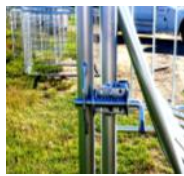
Latch options for gates: vertical, chain and spring loaded latches.