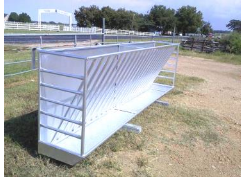
Heavy Duty Wall Mount Feeder, 12' long x 45" tall and 24" wide with a 7" deep trough, can also manufacture these in other sizes