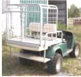
Custom Tote for Cart