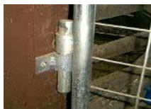
PPFH - Wallpockets can be utilized to connect to walls.