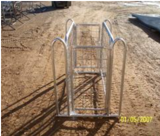
New style of scale cage.