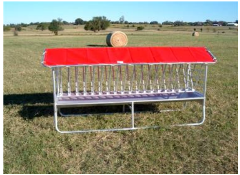
GFHD8 - Heavy duty vertical bar hayrack with trough and rain canopy.