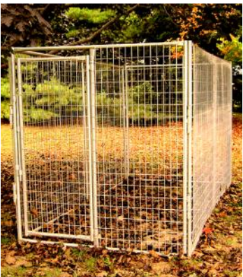
DK505, DK510 - Kennels also come in a variety of sizes. These frames are filled with 2x4" wire.