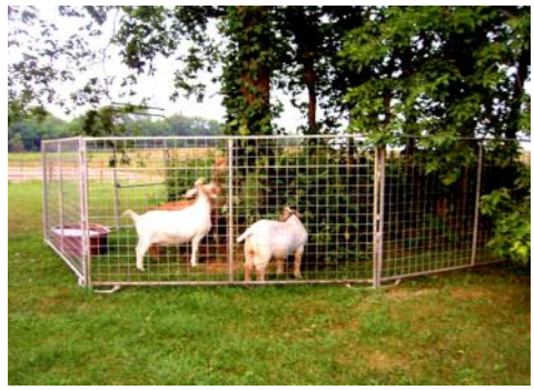
These panels have skid style feet and are filled with 4x4" wire paneling. Pictured at 6' height by 10' length, 7' or 8' at the bowgate.