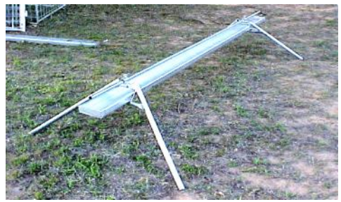
GFE10B - Econo-Trough with no stand bar

EZ410 - EZ Feeder Panel with Hayrack, flap opens and closes to allow them to be contained while pouring the trough. These are great down a center aisle of a barn or fenceline, they keep their heads out of the bucket while pouring the troughs. These can be made in custom sizes and with or without hayracks and walkthrough gates.