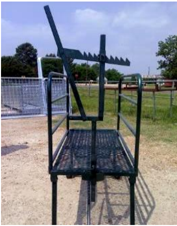
FSHP - Milk Stanchion head piece for our fitting stands has a quick release mechanism