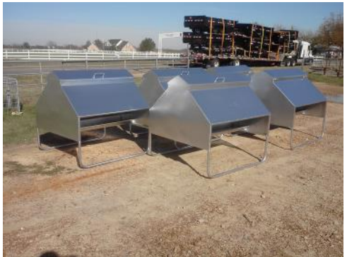
GCFE - Double sided feeder for sheep and goats, lower clearance to prevent pawing at troughs and to keep rain out of troughs