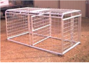
GTF8 - 8' Goat Tote with Divider