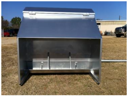
A full feeder for swine.