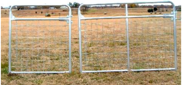
SG04, SG06 - 4x4" wire filled Sheep and Goat pasture gates come in a variety of lengths as well as custom.