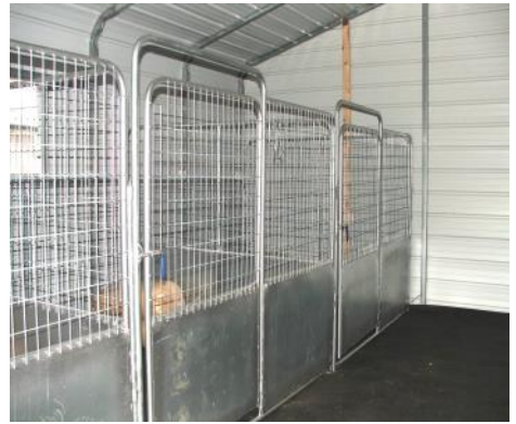
Pictures showing custom options for horse stalls and or livestock pens.