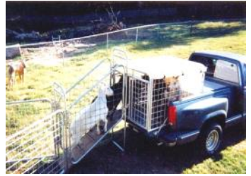
LC200 - Loading chute in use