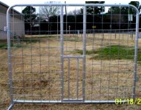
GCFE - Creep door front panel can work in combination with panels for a creep area