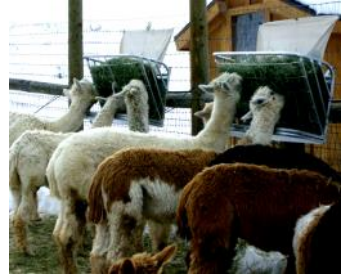
Show pen feeders can be built in larger sizes to accommodate groups.