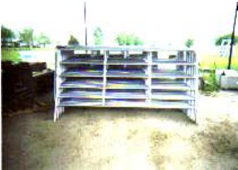
Another panel style with legs versus the skid style feet, skid feet also available. Shown are the horizontal bar style panels. Panels available in medium or heavier gauge.