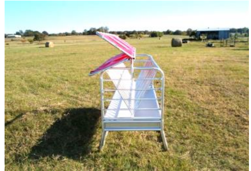
GFHD8 - Rain Canopy opens up