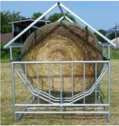
BB1000 and BB1000R - Cradle Style Big Round Bale Feeder/Roof System