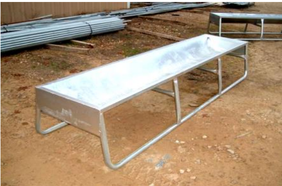
Bunk Feeders are great for feeding horses or cattle.