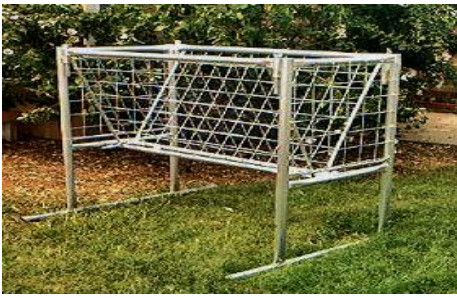
FHR8 - 8' Freestanding Hayrack