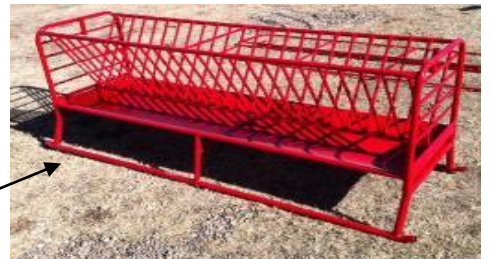
GFHD8 - Heavy duty vertical bar hayrack with trough powder coated red