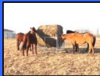
Hay & Grain Feeders