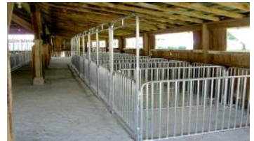
VBG3904, VB3906 - Vertical bar panels and gates prevent climbing on panels, a great option for hogs, sheep and goats.