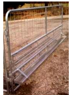
EZ Feeder Panel System has latches to keep feed door shut while trough is being poured