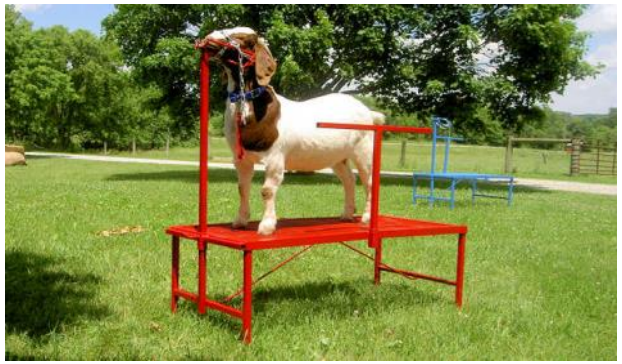
FS, FSWK - Stands come with ramps and legs that fold down for portability. Head pieces are removable and interchangeable along with side rails. Wheel kits can be added, two different style of head pieces.