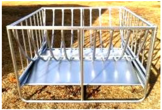
BB1000T - Big Bale Feeder with Trough to catch excess hay