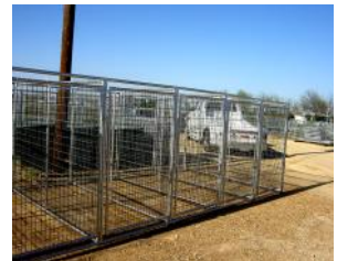
DK505, DK510 - Kennels pin quickly without tools. Kennels can be used for poultry and other livestock as well.