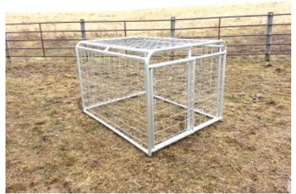
GTF5 - 5' Goat Tote