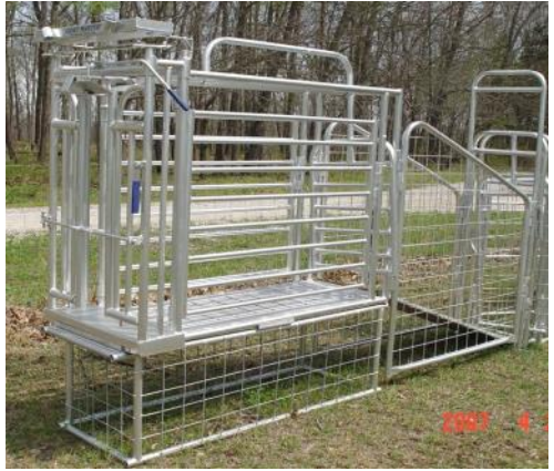
GMWCEL - Goat Master Working Chute