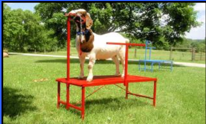
Chariots & Fitting Stands