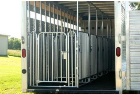
Livestock Pens made custom for stock trailers. Double posted gates and bow-gates combined in this set for easy entry