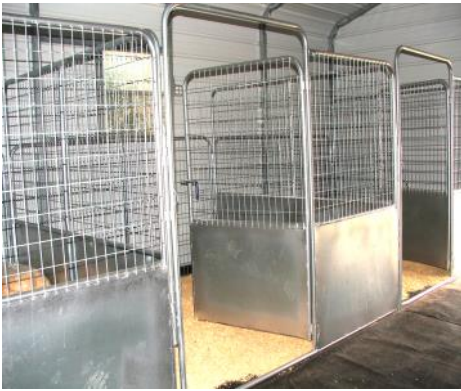
2x4 wire pens, with steel kick plates for added privacy and to keep bedding in. Kick plates can be added in varying heights to pens. Swing doors on panel gates.