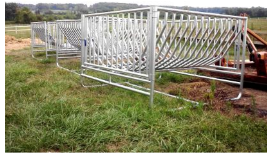
BB1000 - These big bale feeders can also be made with 4x4 wire in place of the vertical bars and with doors that swing open for easy loading