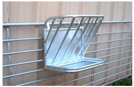
GFKP - Show Pen Feeder, also known as Small Hanging Stall Feeder