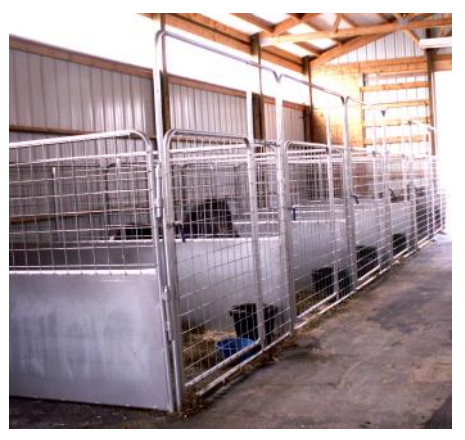
4x4 wire with kick plates on the side panels, miniature horse stalls