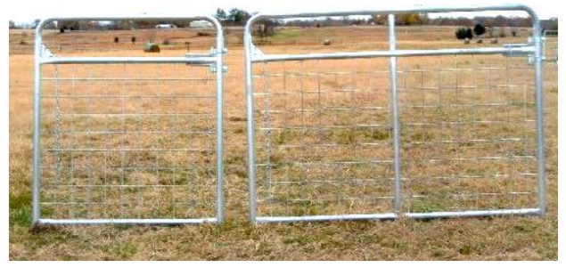
SG04, SG06 - 4x4" wire filled Sheep and Goat pasture gates come in a variety of lengths as well as custom.

Fitting stands available in a variety of colors.