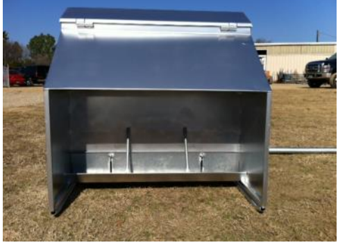
A full feeder for swine.