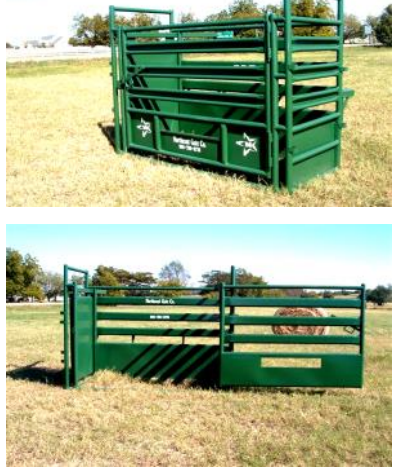
Rough Stock Bucking Chute