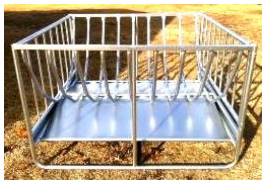
BB1000T - Big Bale Feeder with Trough to catch excess hay