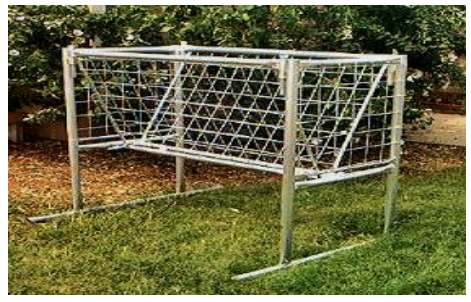
FHR8 - 8' Freestanding Hayrack