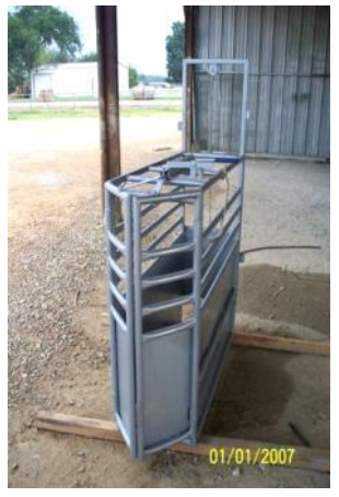
Smaller version of our calf roping chute.