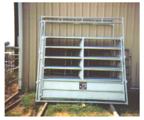
Round Pen gates and panels. Many sizes and options available, call for pricing.