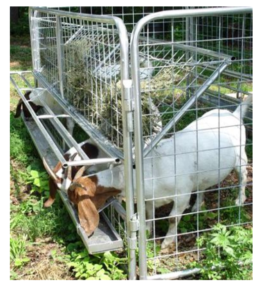
EZ410 - EZ Feeder Panel with Hayrack, flap opens and closes to allow them to be contained while pouring the trough. These are great down a center aisle of a barn or fenceline, they keep their heads out of the bucket while pouring the troughs. These can be made in custom sizes and with or without hayracks and walkthrough gates.