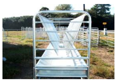
HF8 - 8' Heavy Duty Hay Rack vertical bars.