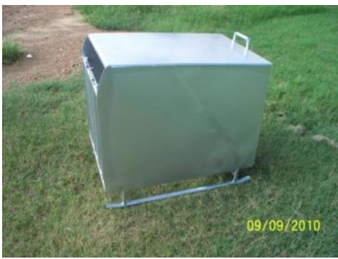
GCFMINI - 150lb creep feeder with roller bars, keeps does/ewes out but lets the kids/ lambs in to eat