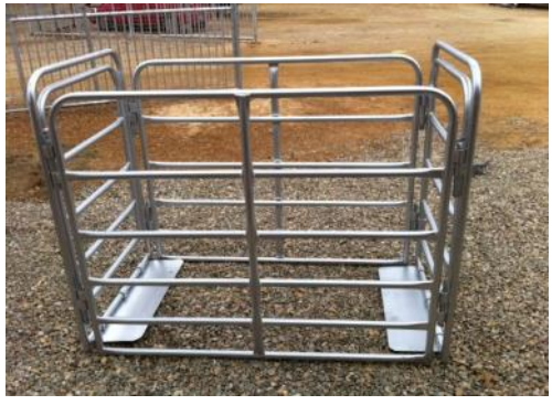
Calf Scale Cage, easy way to keep track of your calfs birth weight without the expense of the high dollar large livestock scales. Scales available that weigh livestock up to 700lbs.