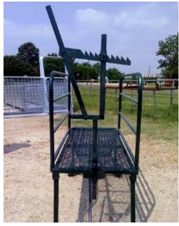
FSHP - Milk Stanchion head piece for our fitting stands has a quick release mechanism