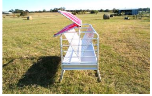
GFHD8 - Rain Canopy opens up