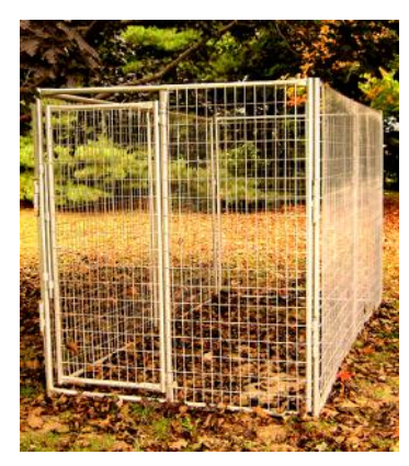
DK505, DK510 - Kennels also come in a variety of sizes. These frames are filled with 2x4" wire.