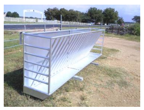
Heavy Duty Wall Mount Feeder, 12' long x 45" tall and 24" wide with a 7" deep trough, can also manufacture these in other sizes