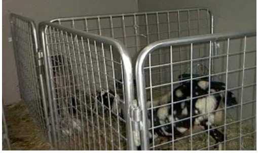
GPG405, GP405 - 4x4 wire heavy duty panels and gates and a 4x4 wire pen using wallpockets.