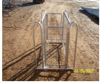
New style of scale cage.

New Water Gate Panel - allows for two areas to share the same trough or allow for feed systems.