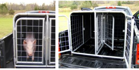
PT5, PT6, PT8 - Tote for Pigs with Four Compartments