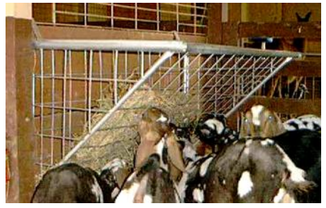
WMHR4 - 4' Wall Mount Hayrack