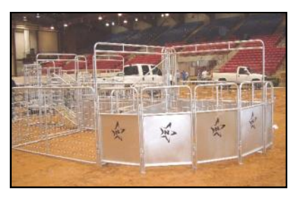
Working Chute Systems