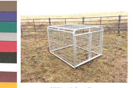
GTF5 - 5' Goat Tote

See our color strip for the colors of covers we offer