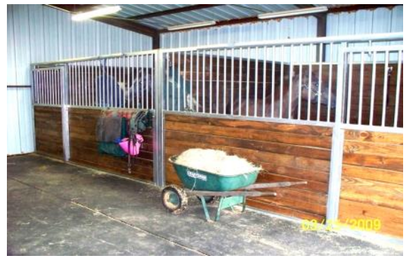
Horse stalls come with swinging doors or sliding roller doors. Add-ons include swing out feed door, bucket door, and feeder.