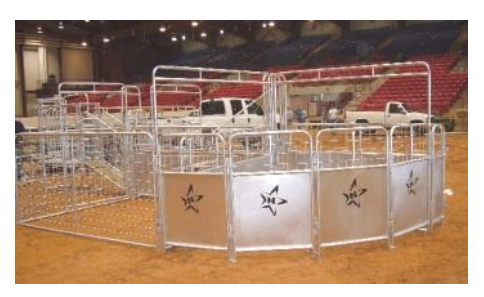
GSTBAS - Our Equipment allows for Various Working Chute configurations