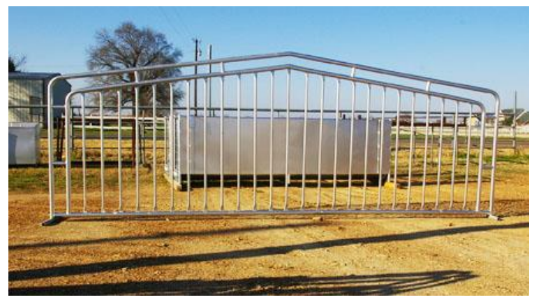
If you are looking to add a personalized farm/ranch gate, we can make those too... From swing gates on up to large scale sliding roller gates, colors are also an option for these