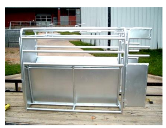
Stripping and Roping Chutes available in electric, remote, and standard options.