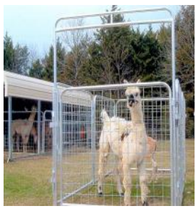
4x4 wire pen can be used for alpacas, llamas or miniature horses.