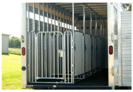
Livestock Pens made custom for stock trailers. Double posted gates and bowgates combined in this set for easy entry