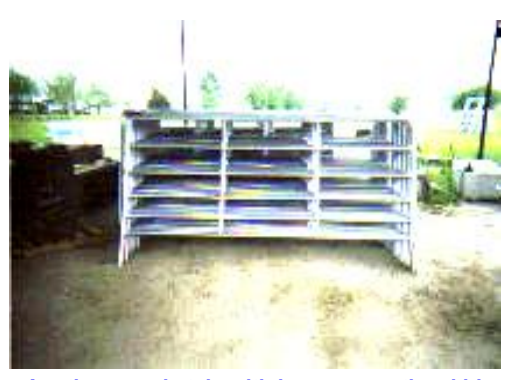
Another panel style with legs versus the skid style feet, skid feet also available. Shown are the horizontal bar style panels. Panels available in medium or heavier gauge.