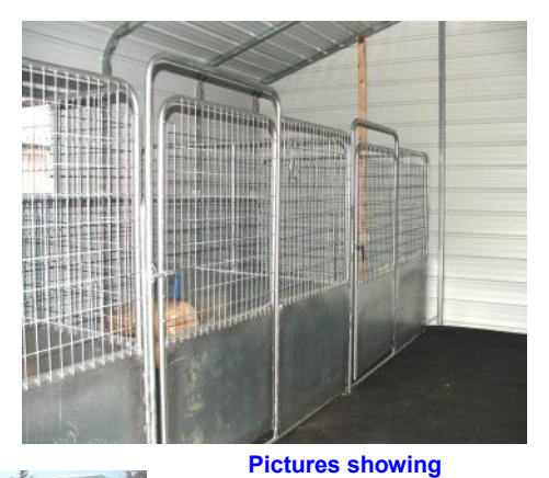
2x4 wire pens, with steel kick plates for added privacy and to keep bedding in. Kick plates can be added in varying heights to pens. Swing doors on panel gates.