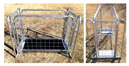
SC660 - Scale Cage and VS660 - Digital Scale, weighs up to 700lbs, *calf cages also available