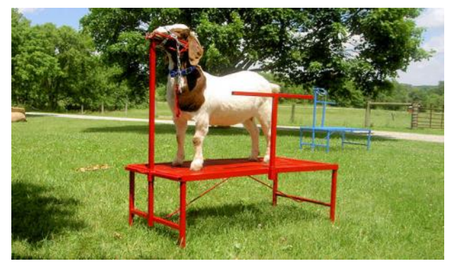
FS, FSWK - Stands come with ramps and legs that fold down for portability. Head pieces are removable and interchangeable along with side rails. Wheel kits can be added, two different style of head pieces.