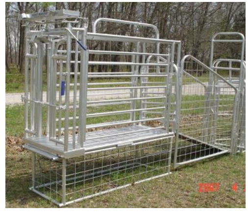
GMWCEL - Goat Master Working Chute