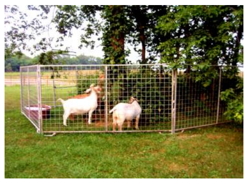
These panels have skid style feet and are filled with 4x4" wire paneling. Pictured at 6' height by 10' length, 7' or 8' at the bowgate.