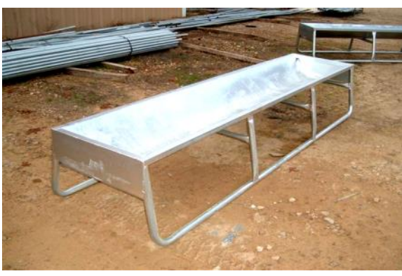
Bunk Feeders are great for feeding horses or cattle.