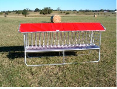
GFHD8 - Heavy duty vertical bar hayrack with trough and rain canopy.

GFHD8 - Heavy duty vertical bar hayrack with trough powder coated red