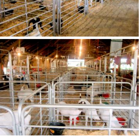
MHBG48, MH405 - Horizontal nine bar panels and gates come in many sizes.