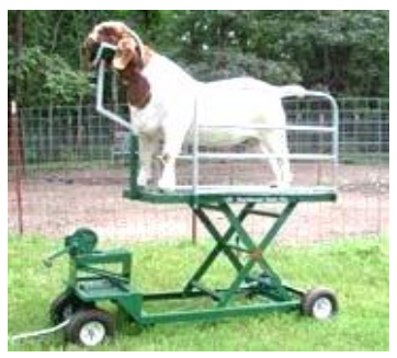
BUTLER - Goat Butler, a unique scissor stand, dollies and raises stock to working levels.