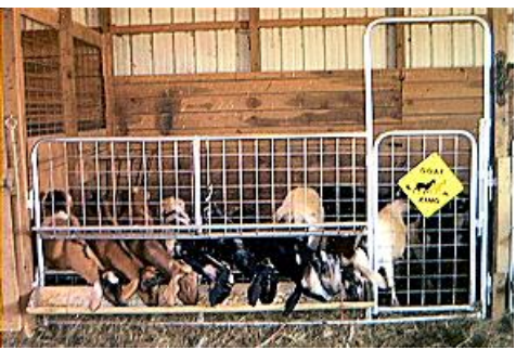
EZG410 - EZ Feeder Panel with Walkthrough Bowgate