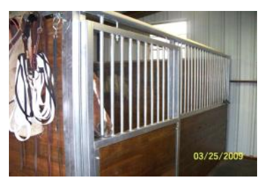
Stalls designed with grills and frames designed for lumber, plywood or sheet metal. Other style options.