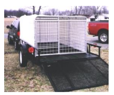
Custom totes can be made to fit landscape and flatbed trailers