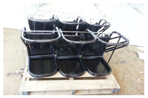
GFMINI– Mini Hanging Stall Feeder, these are great for show pens, equipment can be powder coated, many color choices

GFHD8 - Heavy duty vertical bar hayrack with trough powder coated red