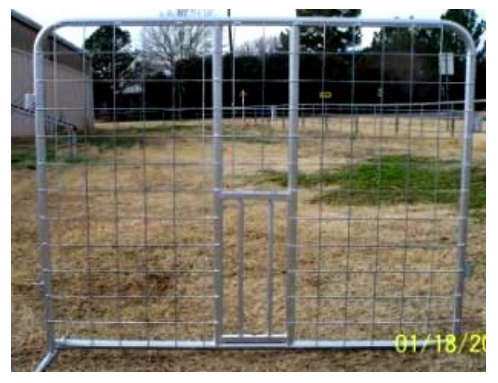
GCFFPO - Creep door front panel can work in combination with panels for a creep area