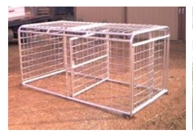
GTF8 - 8' Goat Tote with Divider