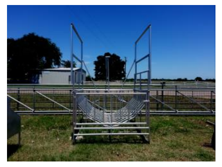
BB1000R - The roofing system opens up to help in the loading process.