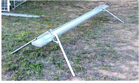
GFE10B - Econo-Trough with no stand bar